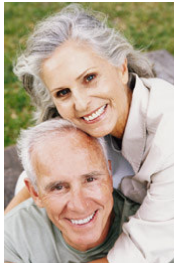
Retired in South Africa

© 2009 SA Migration. All rights reserved