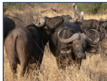
South African Games (click on pic for full size)