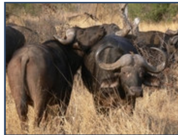
South African Games (click on pic for full size)