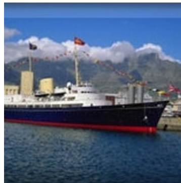
Ocean Liner, Cape Town