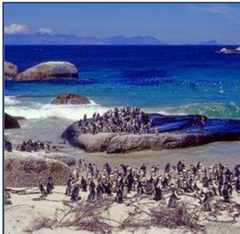
Penguinsat Boulders Beach, Simons Town near Cape Town (click on pic for full size)