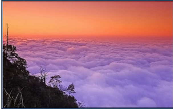
View from Drakensberg (Click on pick for full size)