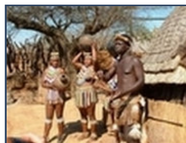
Zulu Village (click on pic for full size)

It's 2010 and our spirits are lifted by this monument to ambition, celebration and peace.