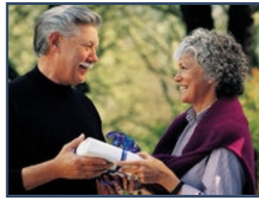
Retired in South Africa