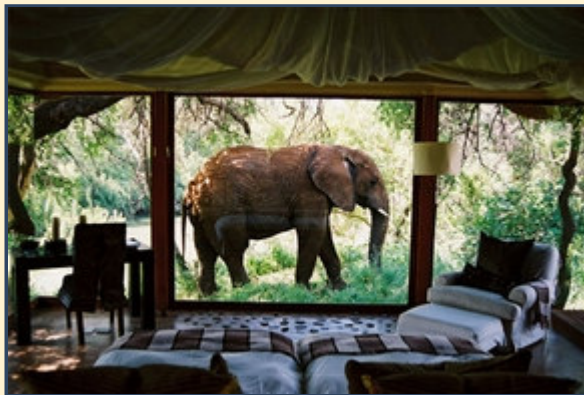
Close encounter with Elephant in Game Reserve, South Africa (click on pic for full size)