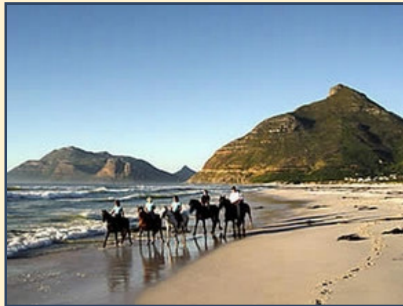
Horse riding on Cape Town's Nordhoek, Long Beach (click on pic for full size)