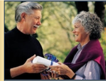
Retired in South Africa

12. Jan. 2011 Sourced by SA - The Good News, Author: