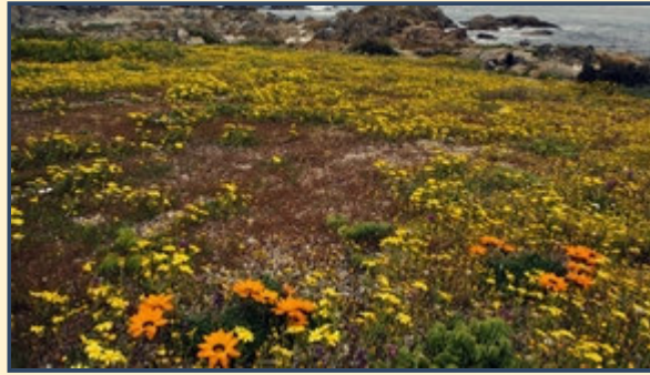
West Coast spring flowers (click on pic for full size)