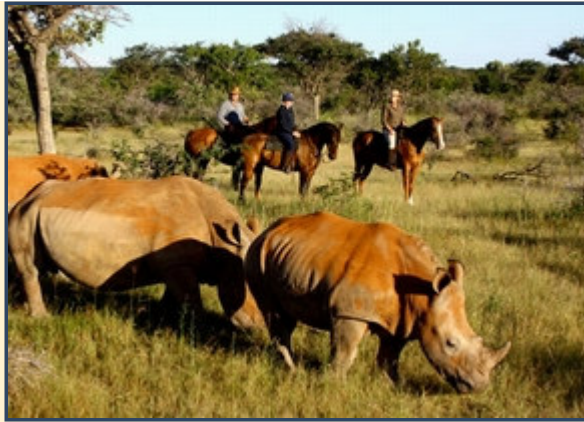
On horse back encounter with rhino in Game Park, South Africa (click on pic for full size)