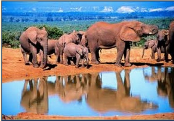
South African Elephants at waterhole in Game Reserve (click on pic for full size)