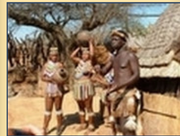
Zulu Village (click on pic for full size)