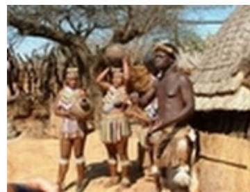
Zulu Village (click on pic for full size)

http://www.sami.co.za/articles?TextNo=1063