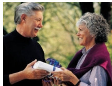
Retired in South Africa (click on pic for your retirement info)

http://www.sami.co.za/articles?TextNo=1072